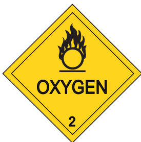
Fig. 4 Oxygen shipping label.